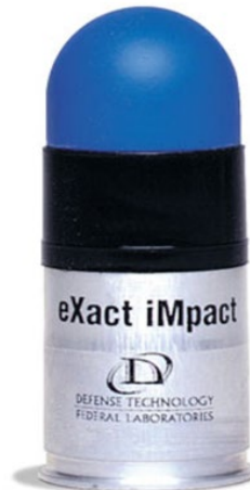
eXact iMpacT 40mm sponge round (XM1006)

The projectile is made up of a high density sponge nose that is aerodynamic in flight. The nose provides the largest impact surface available from a standard bore munition assuring non penetrating impact. In addition the nose acts as a dampening material which allows the XM1006 to be shot at extremely close range with no greater risk of injury to the subject. This is what an XM1006 round looks like: